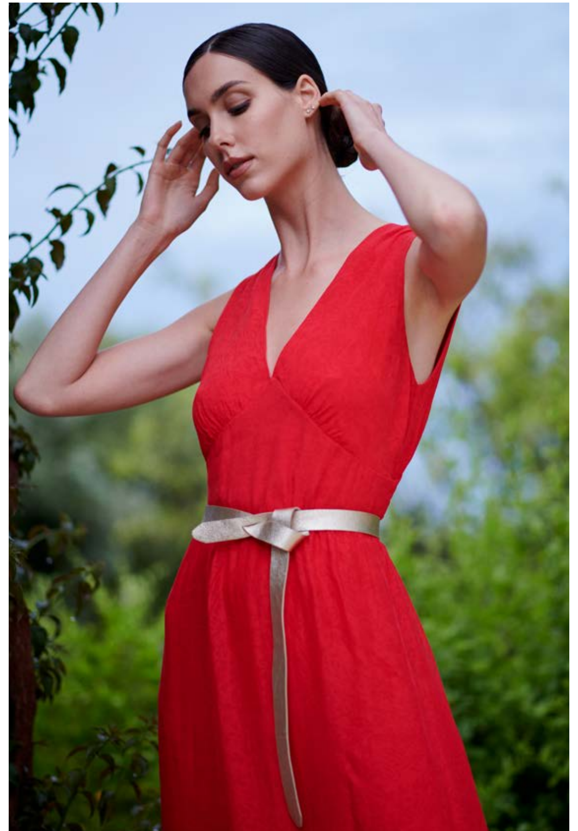
MKP4-36-11 Abito smanicato lungo rovi MKP4-40-07 Fuscaccia bassa pelle