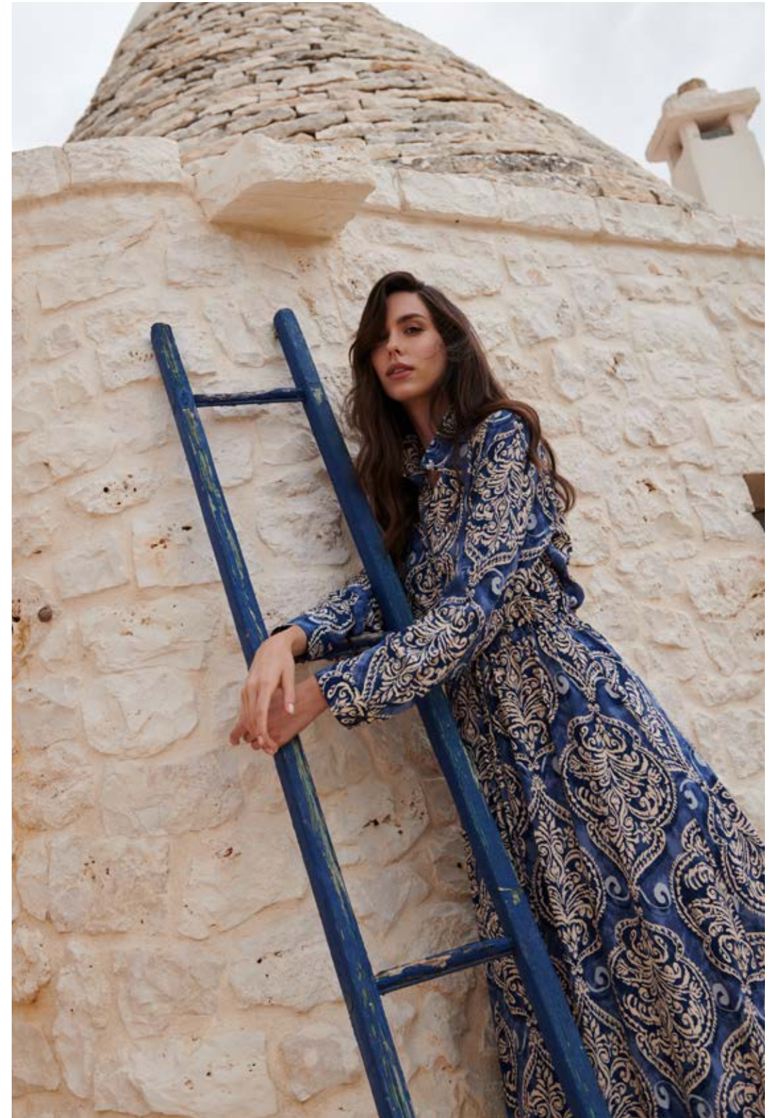
MKP4-36-24 Abito lungo geisha