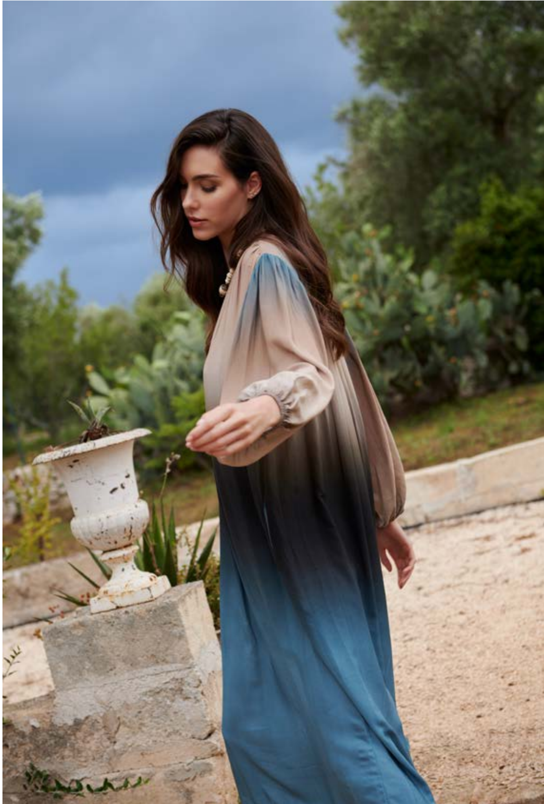
MKP4-36-15 Abito midi tye-dye