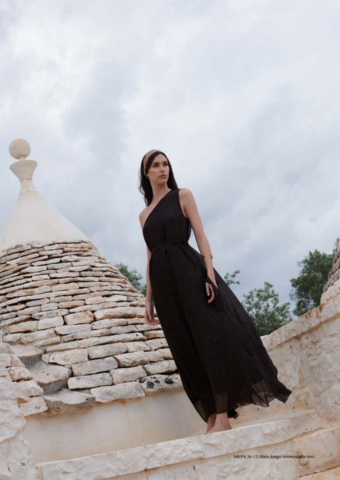
MKP4-36-12 Abito lungo monospalla rovi