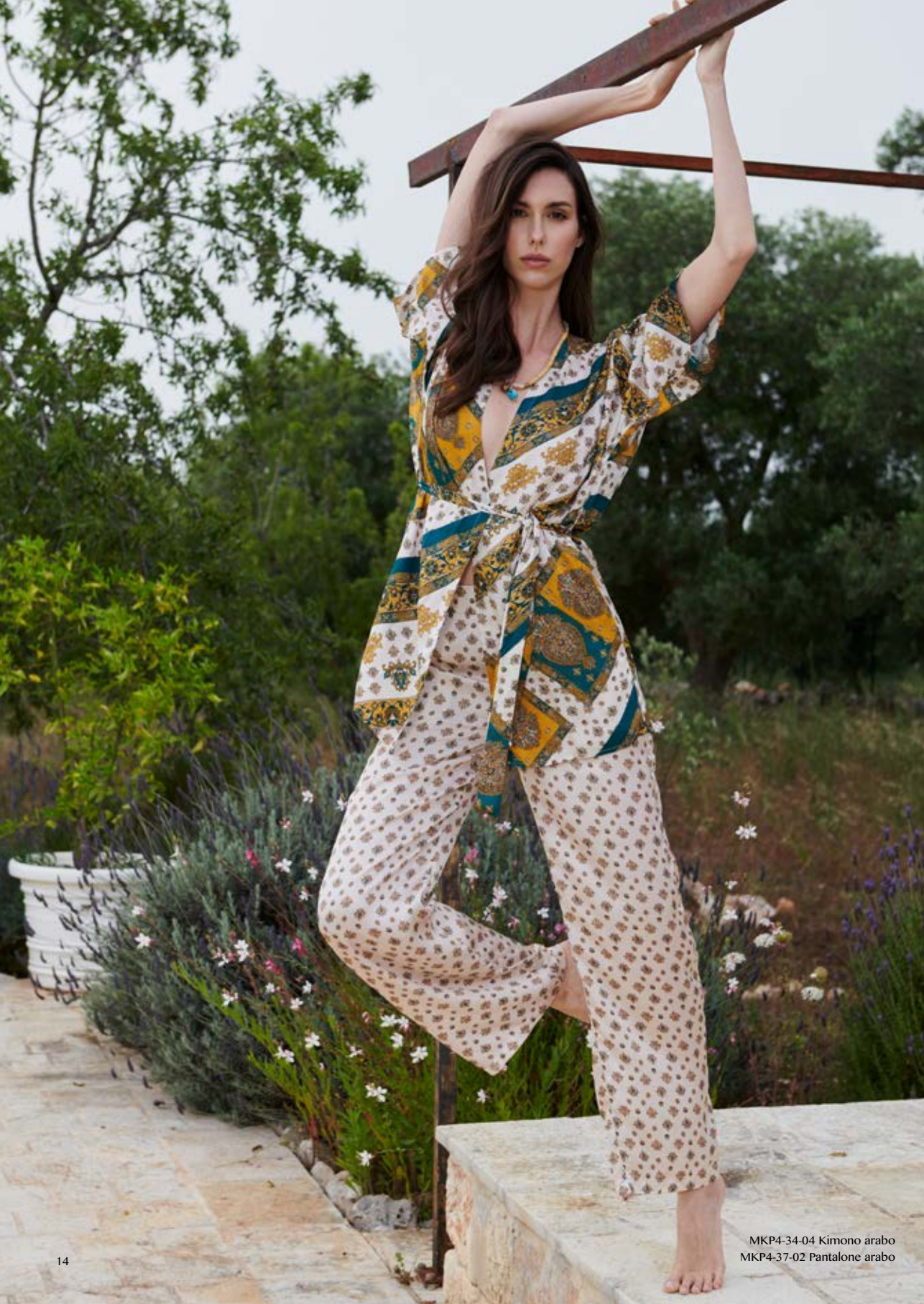
MKP4-34-04 Kimono arabo MKP4-37-02 Pantalone arabo