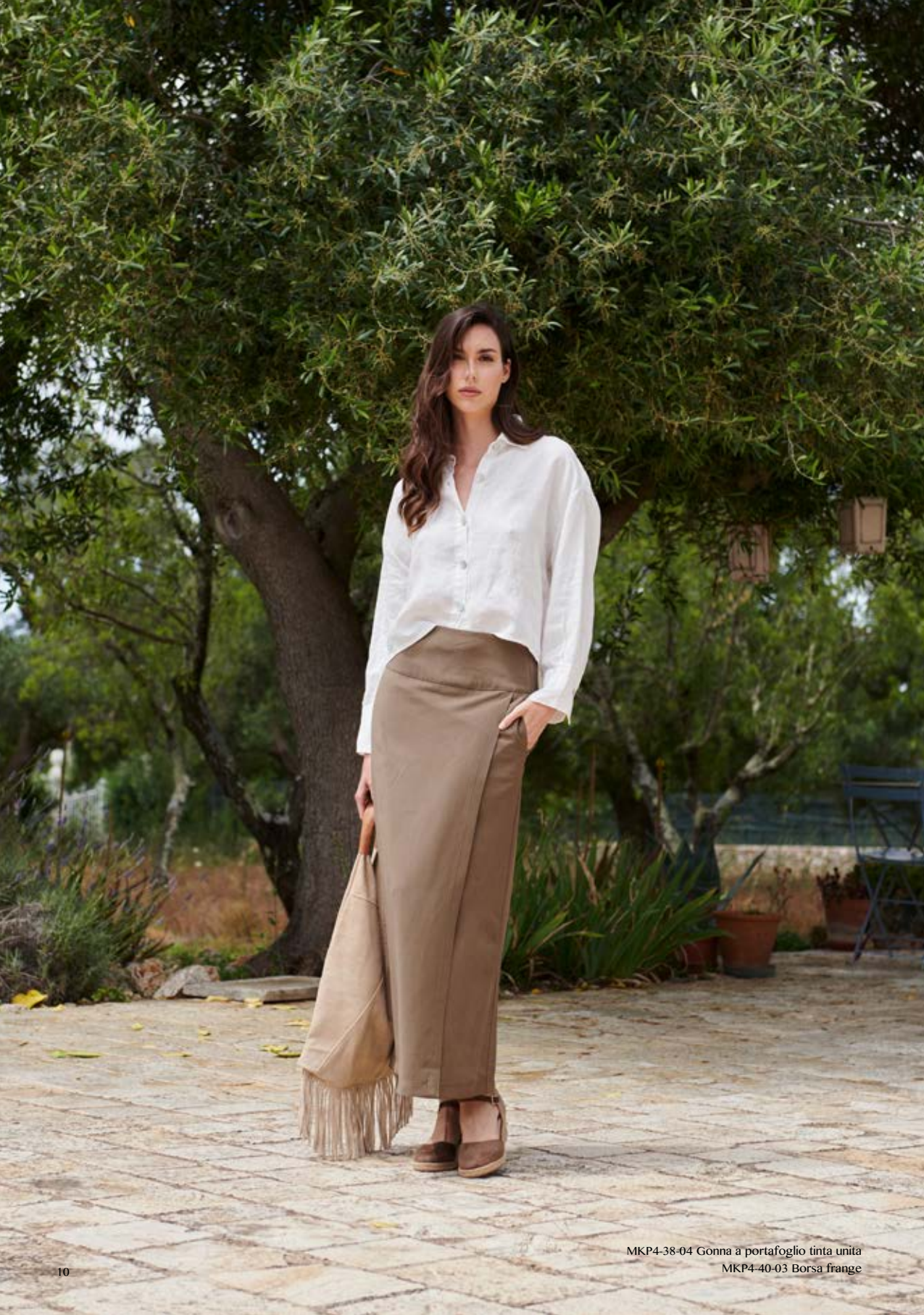
MKP4-38-04 Gonna a portafoglio tinta unita MKP4-40-03 Borsa frange