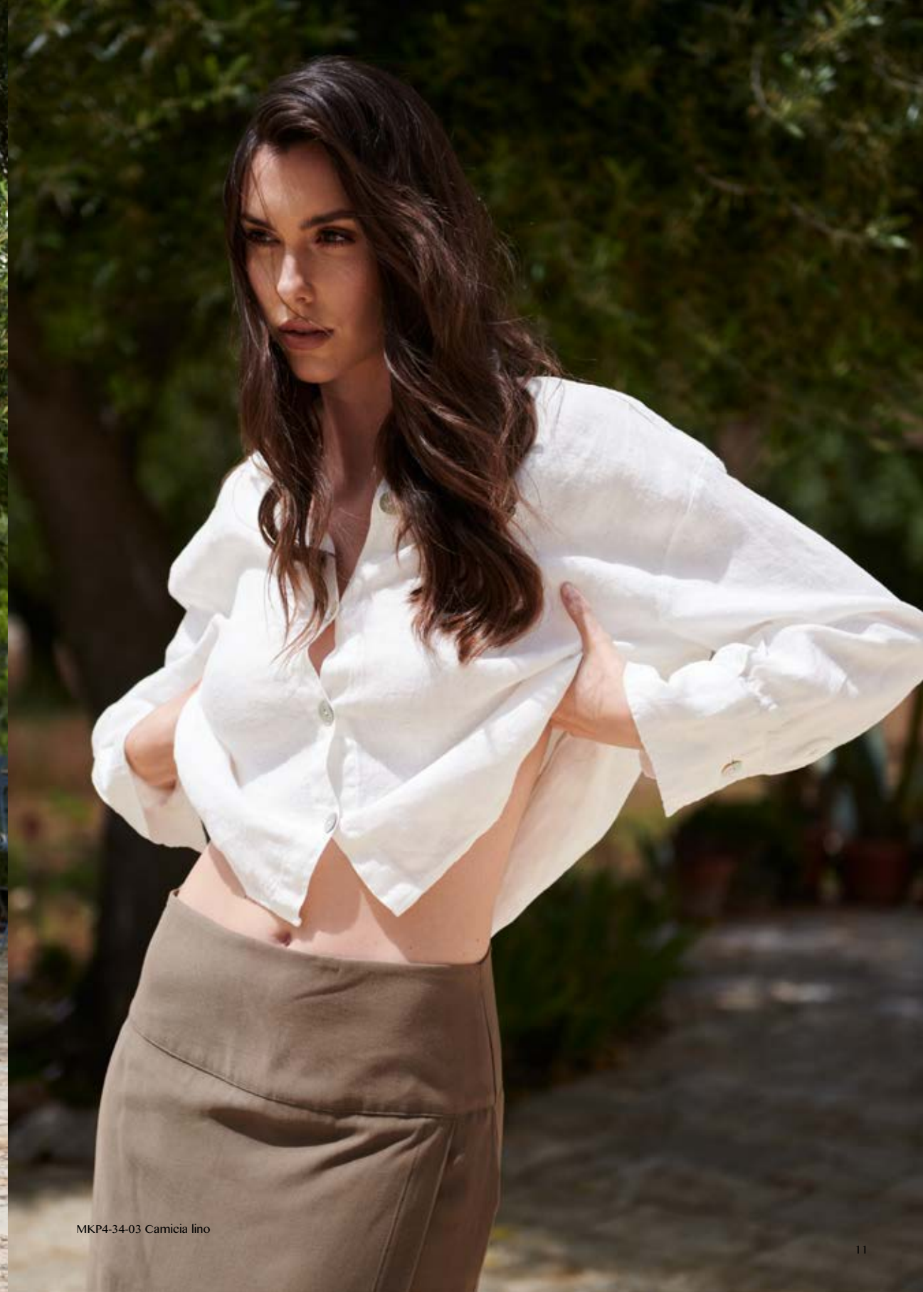
MKP4-34-03 Camicia lino