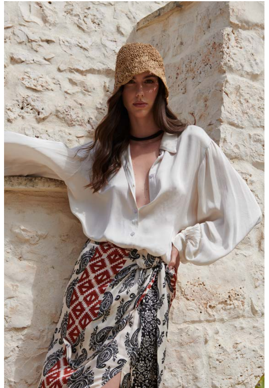
MKP4-34-08 Camicia viscosa MKP4-40-05 Cappello