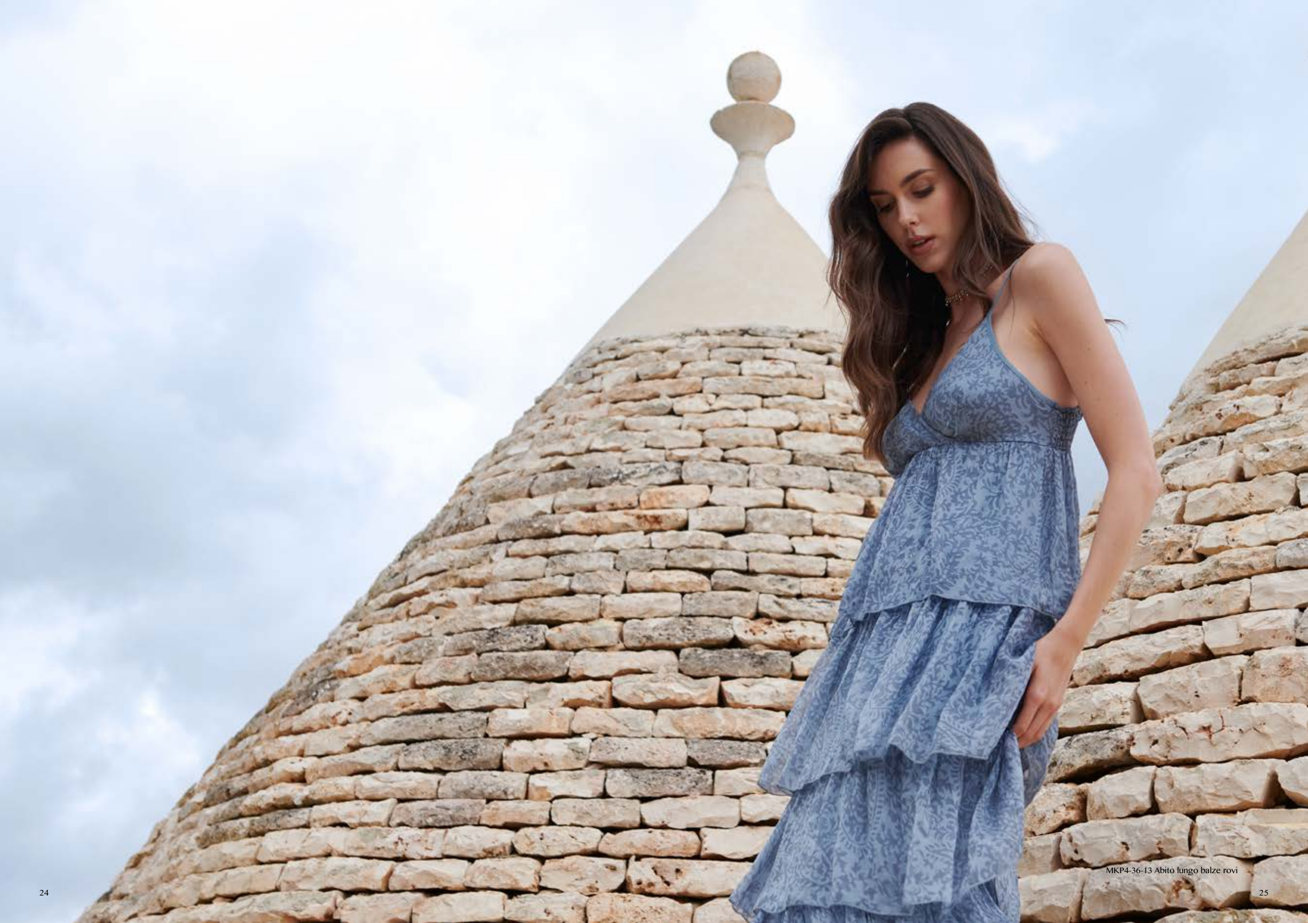
MKP4-36-13 Abito lungo balze rovi