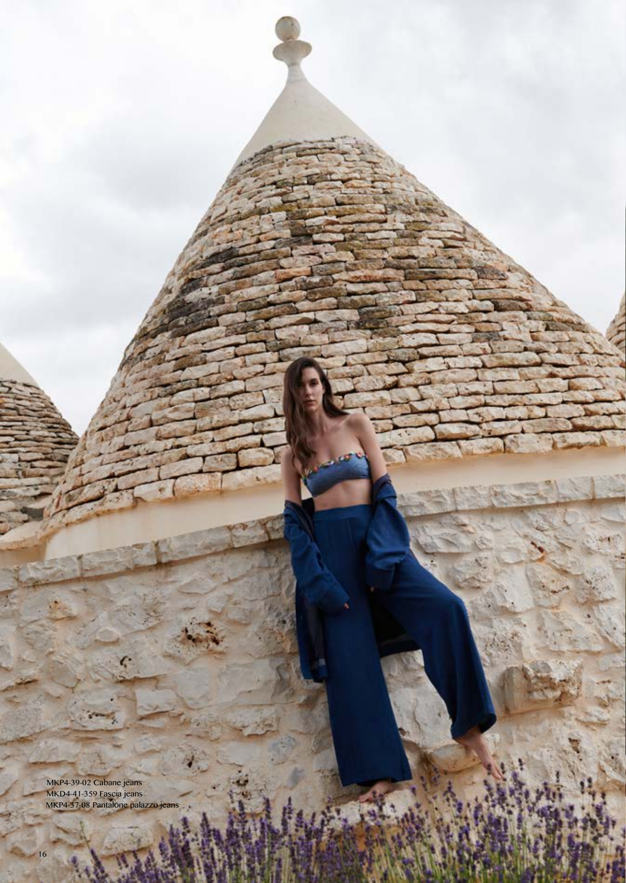
MKP4-39-02 Cabane jeans MKD4-41-359 Fascia jeans MKP4-37-08 Pantalone palazzo jeans