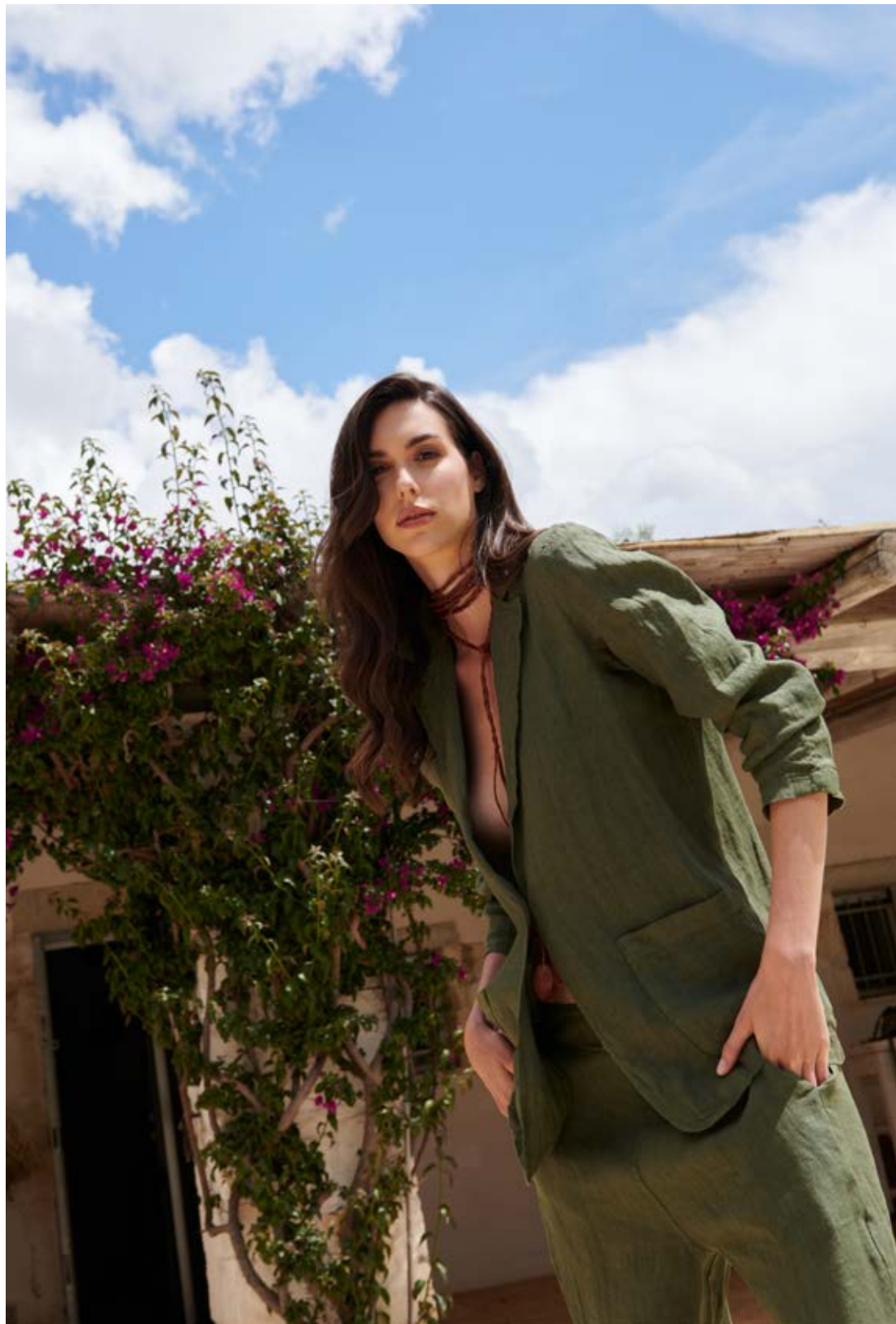
MKP4-39-01 Giacca lino MKP4-37-05 Pantalone lino