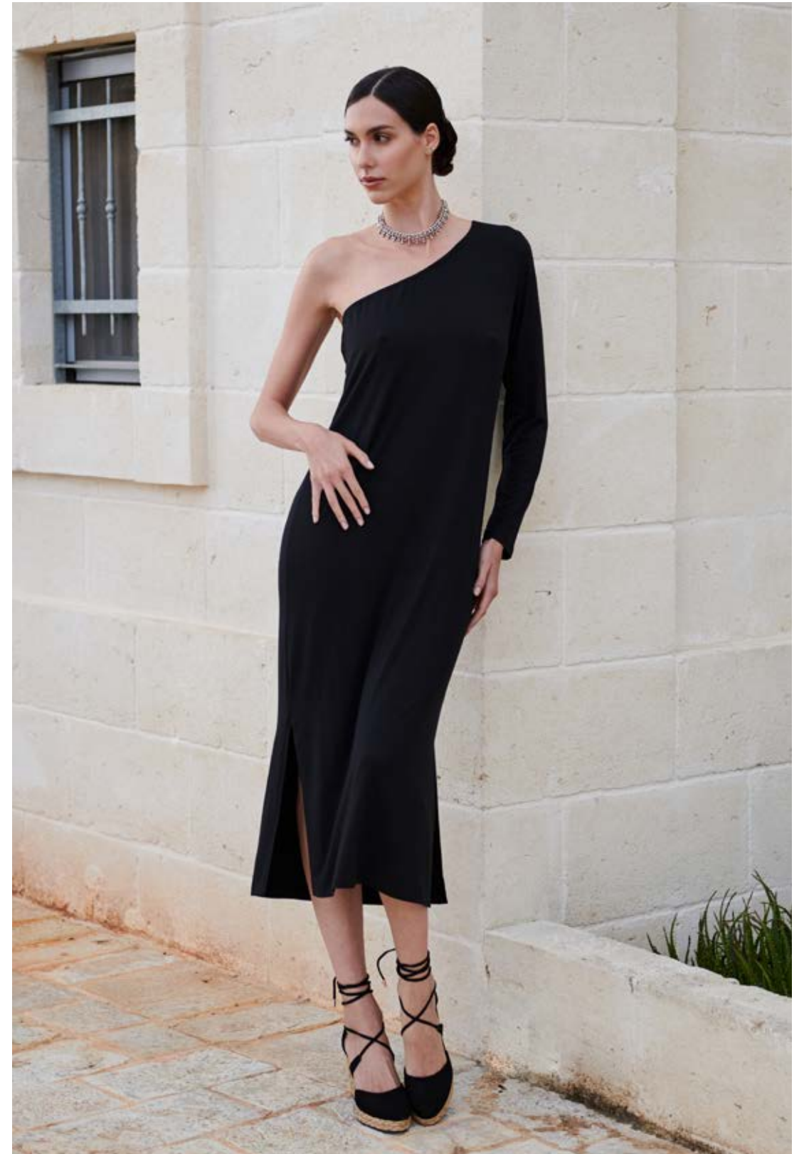
MKP4-36-22 Abito midi monospalla jersey